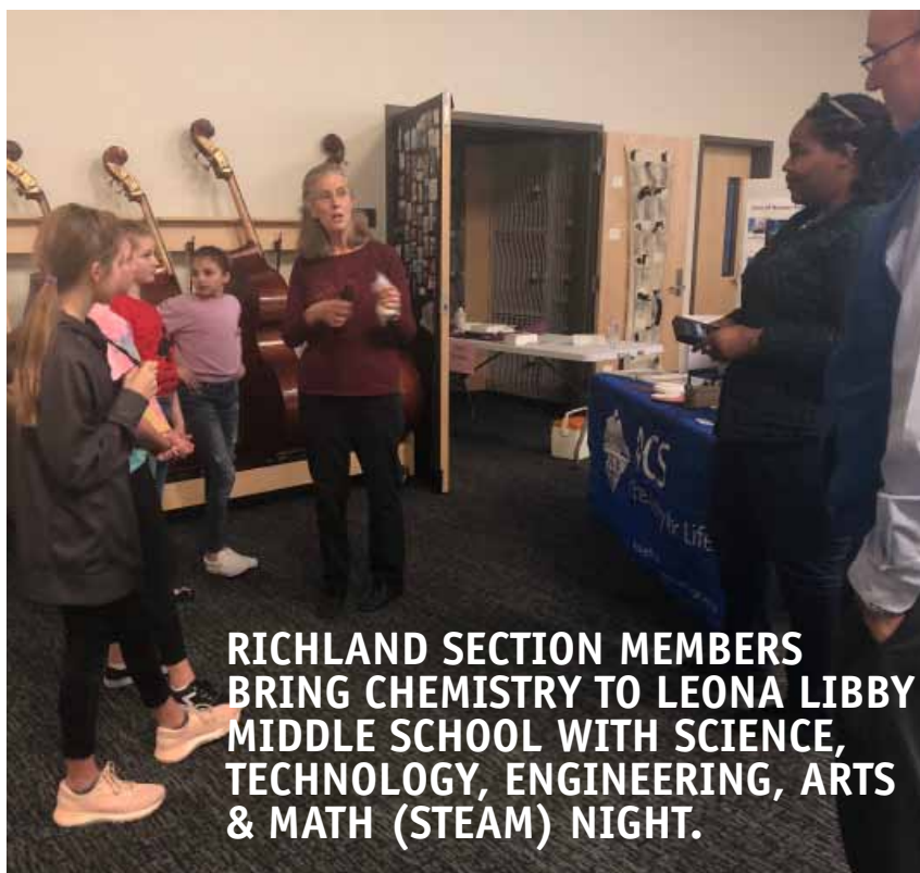
RICHLAND SECTION MEMBERS BRING CHEMISTRY TO LEONA LIBBY MIDDLE SCHOOL WITH SCIENCE, TECHNOLOGY, ENGINEERING, ARTS & MATH (STEAM) NIGHT.

Other sponsors included the Society of Women Engineers (SWE, Eastern Washington Section), Yakima Valley/Tri-Cities Mesa, Women In Nuclear (WIN), Bechtel, and Energy Northwest. The sponsorships assisted in booking the conference venue, helping to register the event through the national EYH program, providing a lunch to students and volunteers, having swag bags to offer the attendees (stocked with useful items such as notepads, pens, and water bottles), and allowing the committee to offer EYH scholarships.